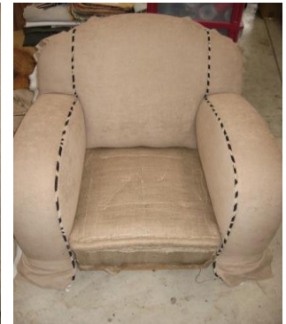
5-8: Recover arms and backs of chairs, re-spring seats, make new rolled edge foundations