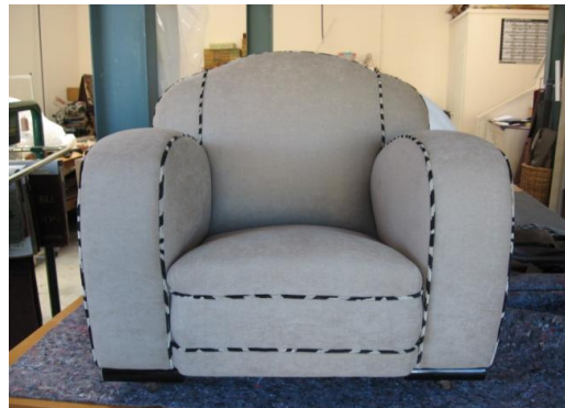
9: Completely refurbished arm chair